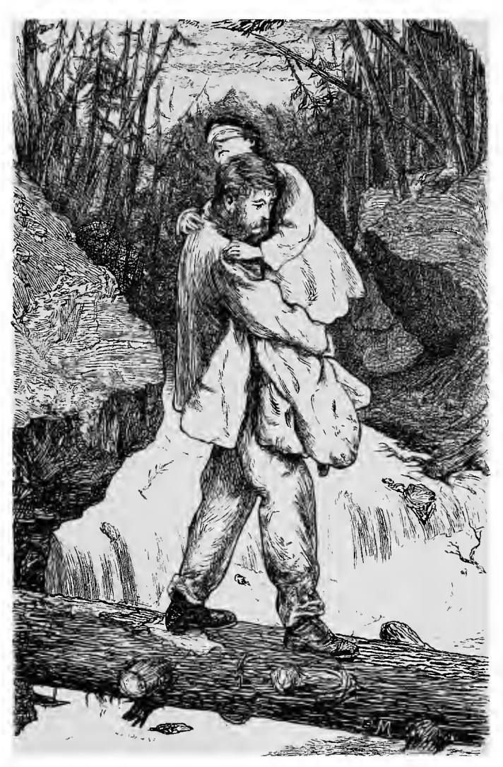
Over the Forester's Bridge.